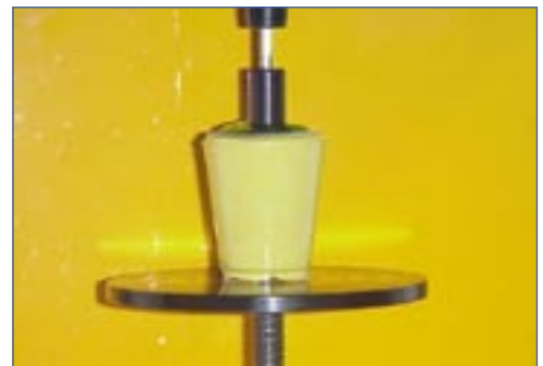
Probe travels into sample in controlled manner while the Texture Analyser continuously collects load response.