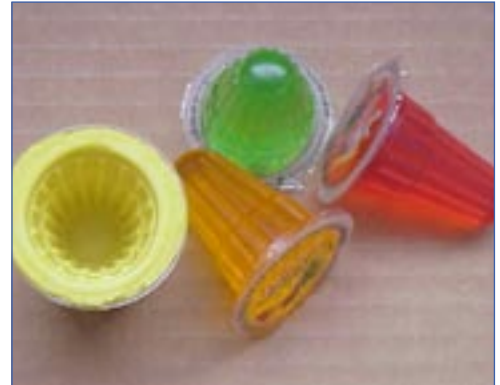
Conical shaped mini cup jellies are supported during test by specially-designed holder.