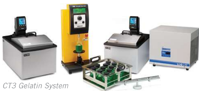
CT3 Gelatin System

AMETEK Brookfield’s compact design of the CT3 has a long heritage dating from the Stevens gelatin Bloom tester. The CT3 still contains the Bloom test method and we now offer the complete gelatin bath preparation system along with GMIA and GME approved Bloom bottles. The system includes a CT3, a rack allowing easy handling of twelve Bloom bottles, two TC-450MX large reservoir baths and a TC-351 chiller.